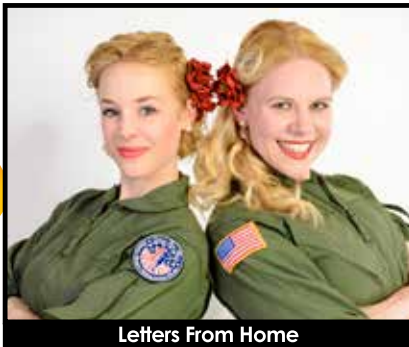
Letters From Home